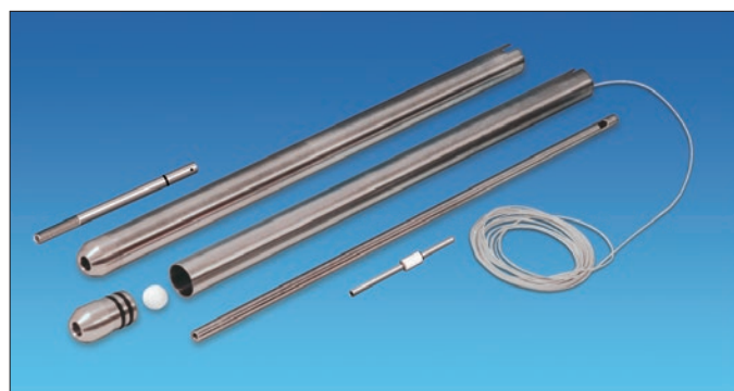
Point Source Bailers come in standard lengths of 2 ft. (610 mm), 3 ft. (910 mm), or 4 ft. (1220 mm)

The miniature 0.5" (12.7 mm) diameter model is ideal for use in narrow tubes and direct push devices.